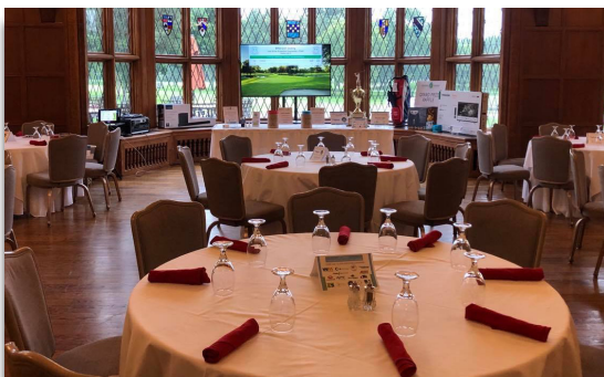
<<< The banquet setup inside the club. This was our first year back at Dearborn Country Club since 2016. The DCC has always been considered "home" for the EMA's golf outing, and we are happy to be back!!